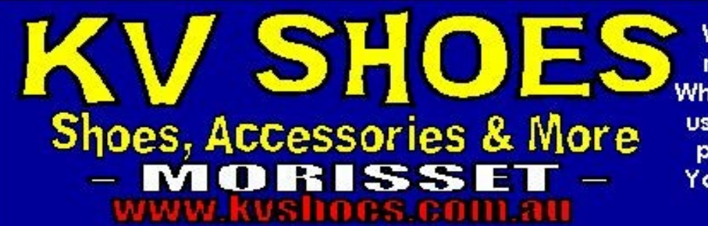
Walk down the ramp near Ray White Real Estate or use our large carpark located off Yambo St, behind Woolworths