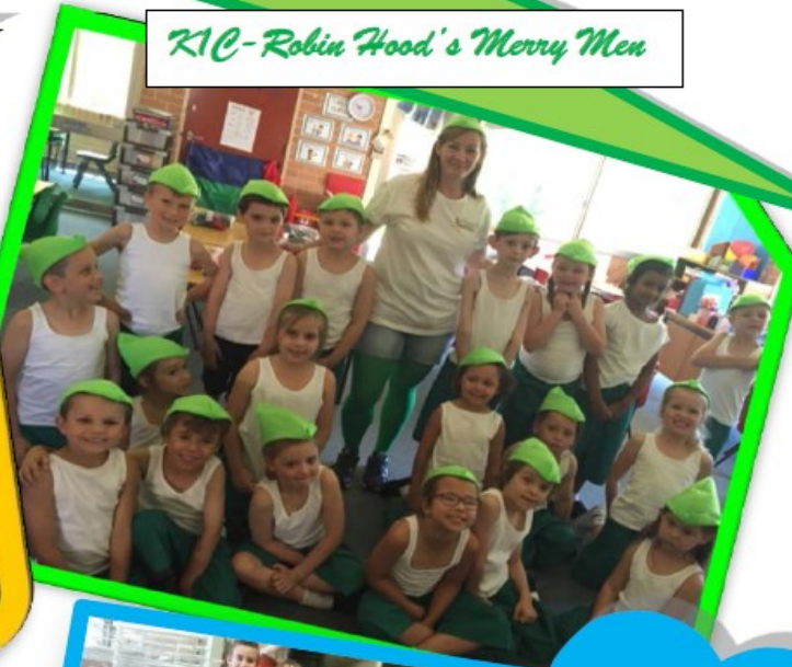
K1C- Robin Hood's Merry Men