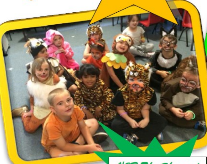
KG- Scouts of the Forest