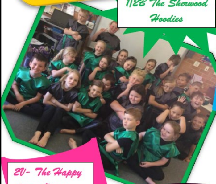
1/2B The Sherwood Hoodies