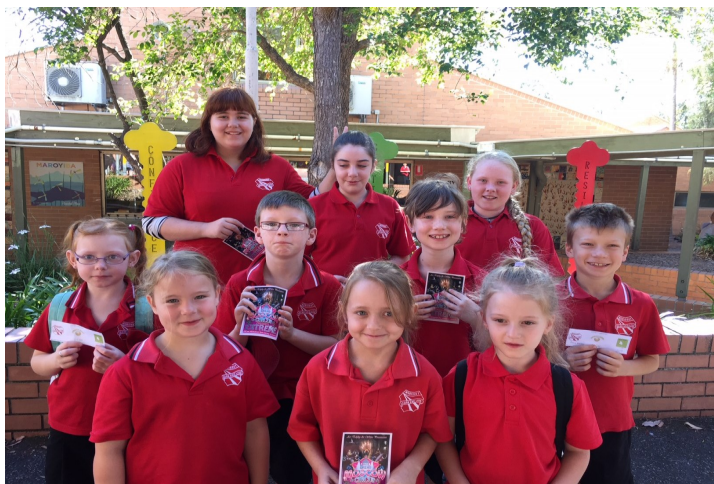
Congratulations to our Winners of PBL Awards!

Friday 8th December, 12-2pm. The day will start with a Special Assembly where we will unveil our PBL Mascot and its Name! Followed by our PBL Carnival that is an opportunity for our Year 6 students to raise money for their gift to the school. All families are welcome to join us for a wonderful celebratory day. All students and their families are encouraged to come dressed in their Sport House Colour as these colours represent our PBL Values; Respect = Red, Safety = Yellow and Engagement = Green.