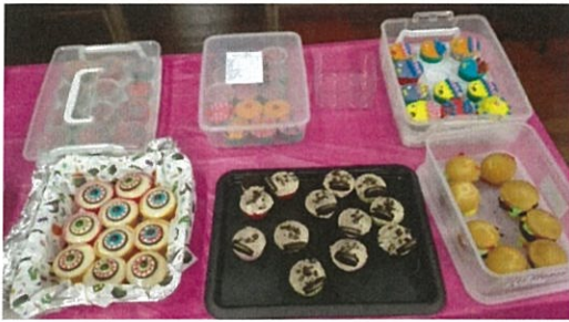
Photos from the Cupcakes for Kids with Cancer fundraiser last Thursday